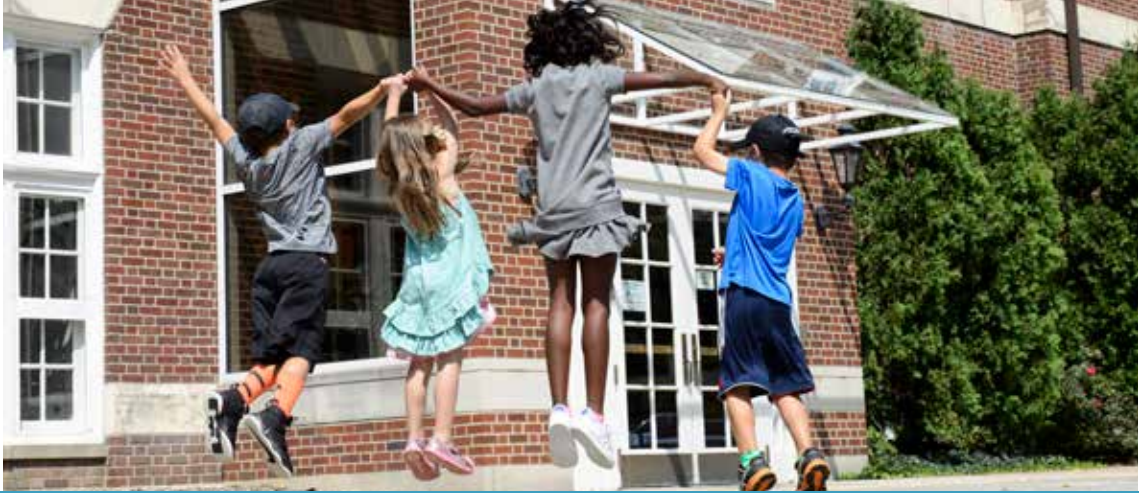
Kim Fonsky Photography